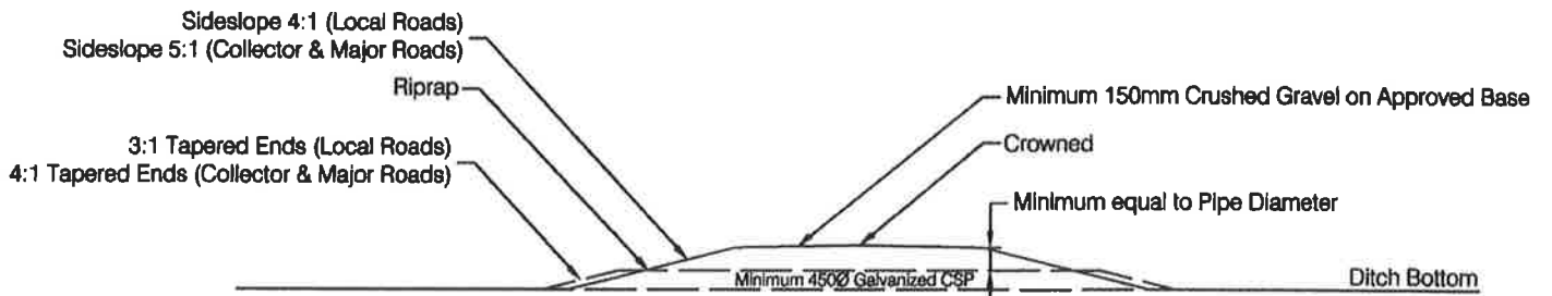
2 Typical Cross Section 1 1:200

NOTE: All dimensions are metres unless otherwise noted.